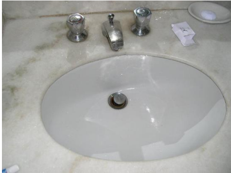
sink or washbasin